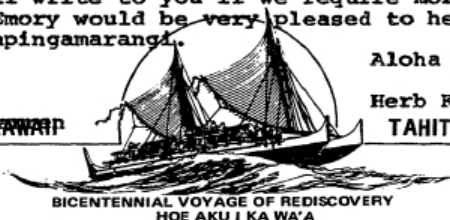
BICENTENNIAL VOYAGE OF REDISCOVERY HOE AKU I KA WA'A