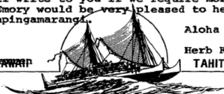
BICENTENNIAL VOYAGE OF REDISCOVERY HOE AKU I KA WA'A