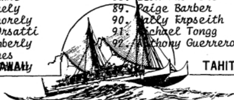
BICENTENNIAL VOYAGE OF REDISCOVERY HOE AKU I KA WA'A