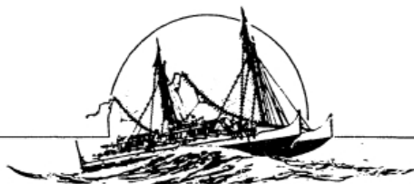
VOYAGE OF REDISCOVERY

our cousin told us to contact him because he is interested, I don't know him at all.