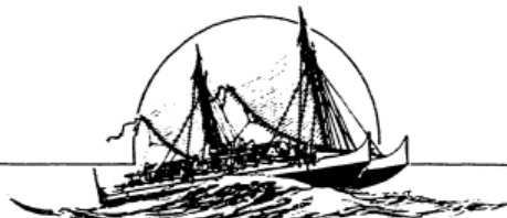
VOYAGE OF REDISCOVERY

Voyage of Rediscovery narrative Budget Board of Directors IRS Letter Sail Plan By-Laws Letters of Support Newspaper Articles