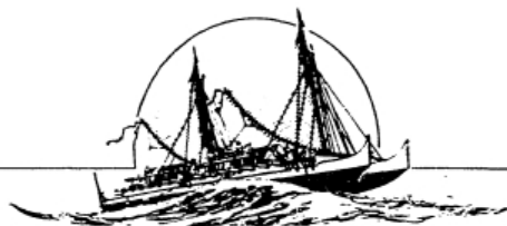
VOYAGE OF REDISCOVERY