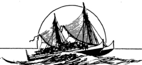
VOYAGE OF REDISCOVERY