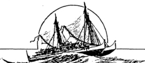
VOYAGE OF REDISCOVERY