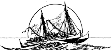
VOYAGE OF REDISCOVERY