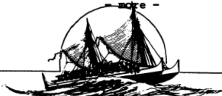
VOYAGE OF REDISCOVERY