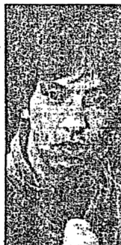
Nainoa Thompson "The whole trip is a risk"

"The estimated sail times are only that — estimates."