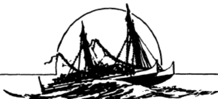
VOYAGE OF REDISCOVERY

Plans are underway for two days of welcome home ceremonies and festivities which will highlight the Voyage of Rediscovery and the human attainments of its crewmembers. Participating dignitaries include the Governor of Hawaii, Pacific island leaders and other Hawaii government officials. There will be television coverage by four local networks.