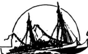
VOYAGE OF REDISCOVERY

We trust this invitation meets with your approval and that you are able to join us for this once-in-a-lifetime event. The Hokule'a is a symbol that belongs to all of Polynesia. Your presence is important. We anticipate you perceive our efforts worthy of your continuing support.