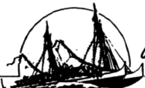
VOYAGE OF REDISCOVERY

We trust this invitation meets with your approval and that you are able to join us for this once-in-a-lifetime event. The Hokule'a is a symbol that belongs to all of Polynesia. Your presence is important. We anticipate you perceive our efforts worthy of your continuing support.