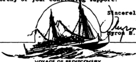
VOYAGE OF REDISCOVERY