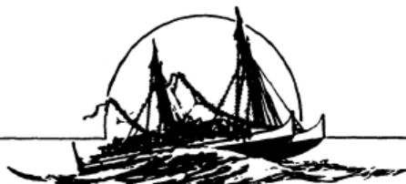
VOYAGE OF REDISCOVERY

Plans are underway for two days of welcome home ceremonies and festivities which will highlight the Voyage of Rediscovery and the human attainments of its crewmembers. Participating dignitaries include the Governor of Hawaii, Pacific island leaders and other Hawaii government officials. There will be television coverage by four local networks.