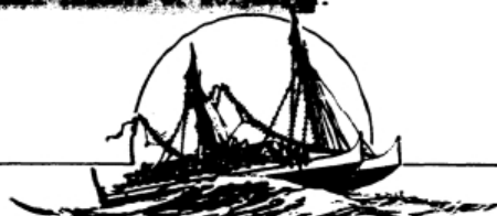
VOYAGE OF REDISCOVERY

The Polynesian Voyaging Society cordially invites you to the opening of the Hokule'a at Papeete, Tahiti, on March 28, 1987. The ceremony will be held at 10:00 AM. The Hokule'a will be accompanied by the Tahiti national flag and the Hawaiian flag. The ceremony will be covered by the four local television networks.