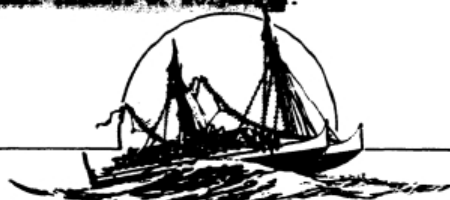
VOYAGE OF REDISCOVERY

The Polynesian Voyaging Society cordially invites you to the opening of the Hokule'a at Papeete, Tahiti, on March 28, 1987. The ceremony will be held at 10:00 AM. The Hokule'a will be accompanied by the Tahiti national flag and the Hawaiian flag. The ceremony will be covered by local television networks.