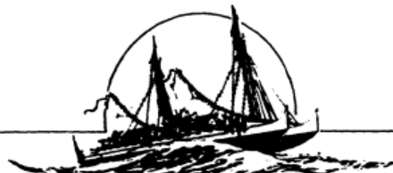
VOYAGE OF REDISCOVERY