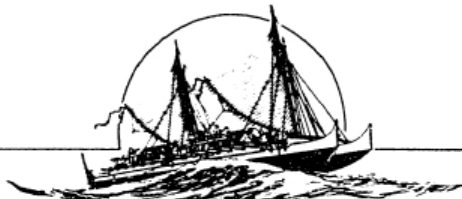
VOYAGE OF REDISCOVERY