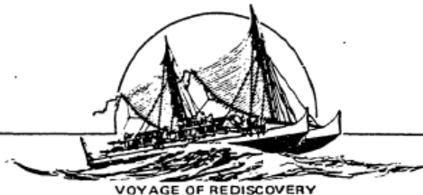
VOYAGE OF REDISCOVERY