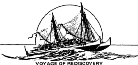
VOYAGE OF REDISCOVERY