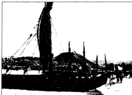
The 45-foot E'ala ("Awaken!") was built in 1979 at Pōka'i Bay to revive the art of canoe building on the Wai'anāe Coast. It was refurbished by the Polynesian Voyaging Society in 1993 for use in crew training and educational programs.